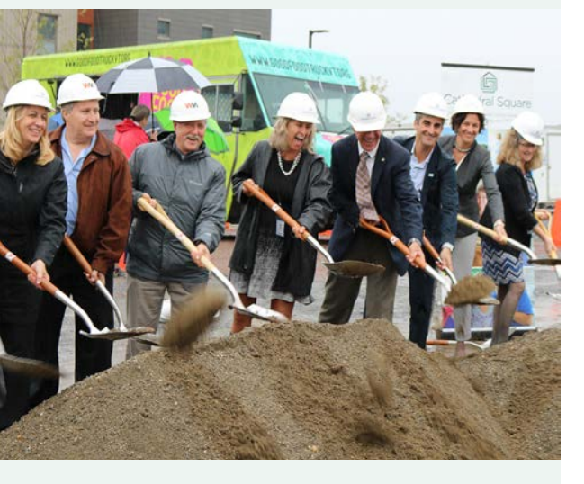
▲ Groundbreaking at Juniper House

Both Juniper House and Red Clover Commons are served by the SASH program, a nationally recognized model of health care coordination providing health and wellness services where people live, partnering with health care providers and local and regional hospitals. Developed by Cathedral Square, SASH has been shown to significantly improve health outcomes while also saving Medicare and Medicaid expenses. The latest independent evaluation of SASH, published in 2019, attributed the savings in Medicaid to the fact that SASH helps participants remain living at home as they age rather than moving to long-term care settings.